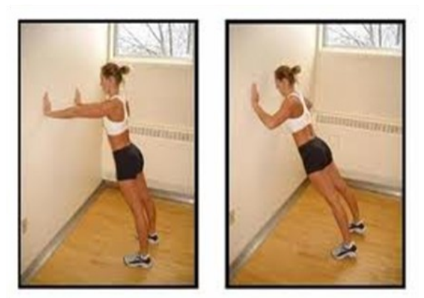
Wall push ups